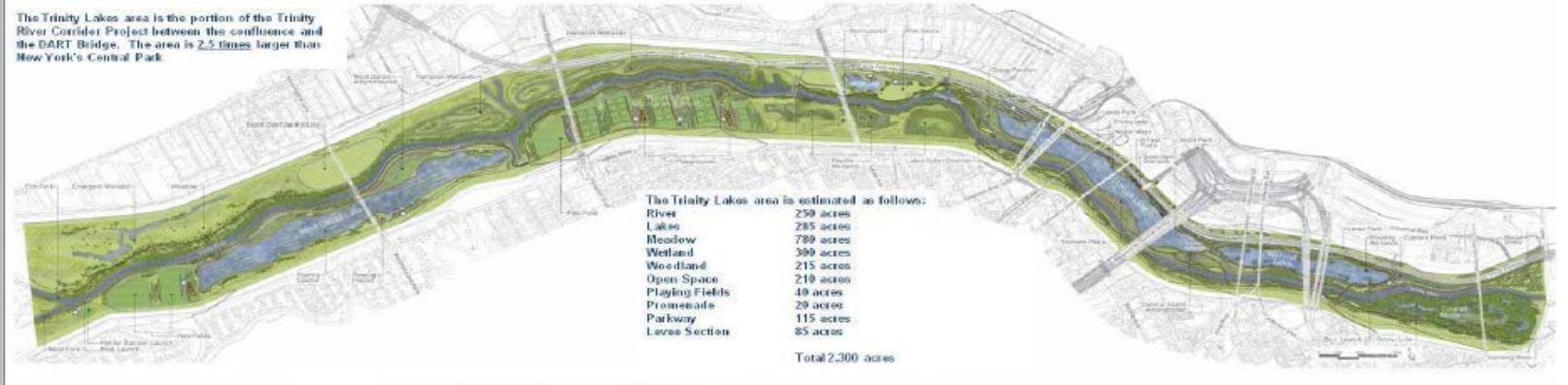
CITY OF DALLAS BALANCED VISION PLAN RENDERINGS – THE TRINITY RIVER CORRIDOR DESIGN GUIDELINES (2009)

The Trinity Lakes area is the portion of the Trinity River Corridor Project between the confluence and the DART Bridge. The area is 2.5 times larger than New York's Central Park.